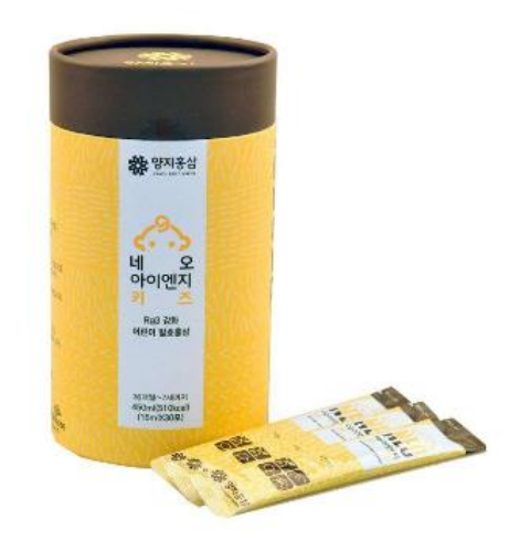
YangJi Korean Red Ginseng NEO ING Kids

Stick type red ginseng extract product 3mg of ginsenoside per pack (for 3-7 years old) 1~2 packs per day