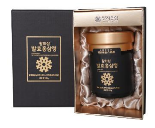
YangJi Korean Red Ginseng HwalHwaSam fermented Concentrate

Ginsenoside 33mg per 3g daily intake (red ginseng concentrate 100%) * product capacity: 240g