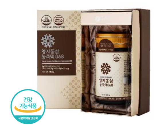
YangJi Korean Red Ginseng Concentrate 068

Ginsenoside 33mg per 3g daily intake (red ginseng concentrate 100%) * product capacity: 240g