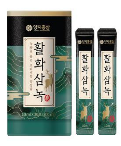
YangJi Korean Red Ginseng HwalHwaSam-deer antlers

Stick type red ginseng extract product 3.5mg of ginsenoside per pack (for 8-13 years old) 1 ~ 2 packs per day