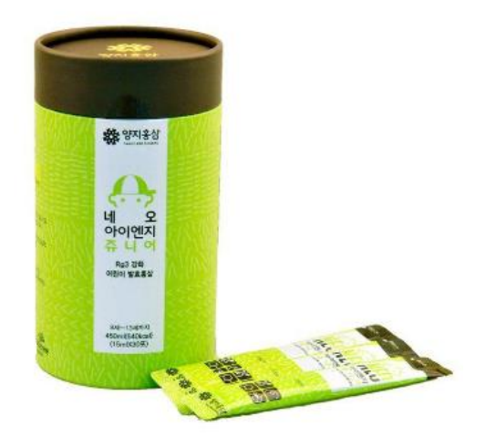
YangJi Korean Red Ginseng NEO ING Junior

Stick type red ginseng extract product 3mg of ginsenoside per pack (for 3-7 years old) 1~2 packs per day