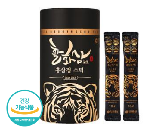
YangJi HwalHwaSam Stick Korean Red Ginseng Extract

Ginsenoside 33mg per 3g daily intake (red ginseng concentrate 100%) * product capacity: 240g