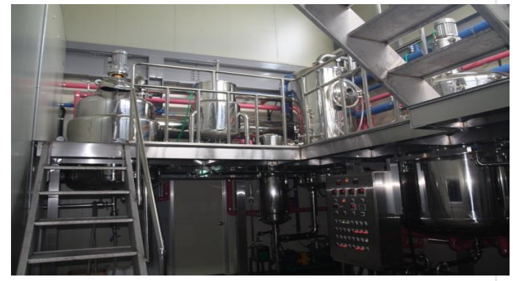
extraction packing line